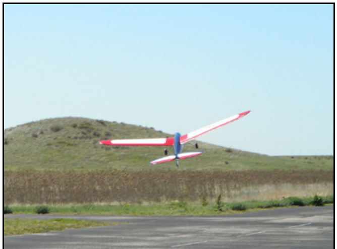
And off it goes...

Everything went well except for a little tail wheel problem on the landing. Looked good in the sky and flew great according to Murray... Over 9' wingspan, about 9 lbs and powered with a 46 size electric motor on a 4 cell lipo spinning a 12 x 6 prop.