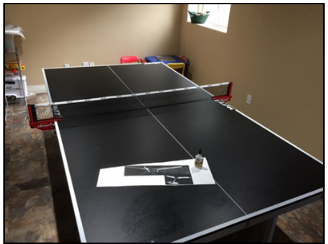
May 2017. A clean workspace, but where's the Cavalier?