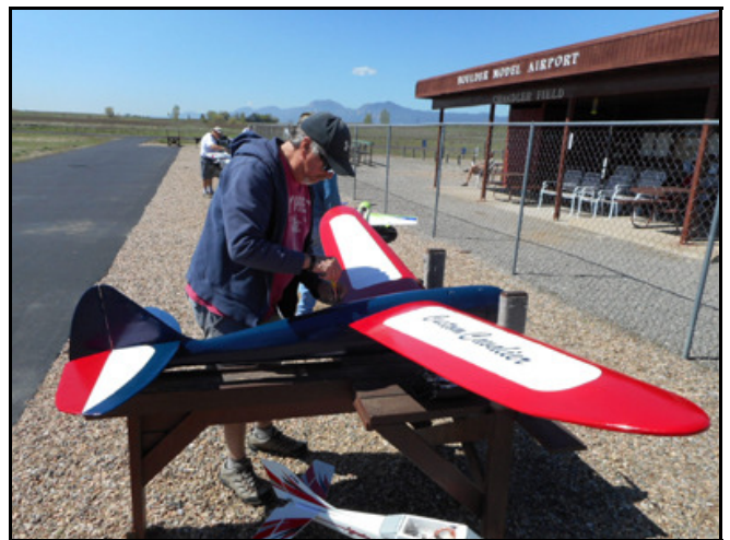
May 12th and it's at the field for it's first flight.