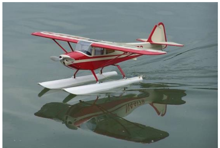
See the kickoff of the float flying season on page 2!