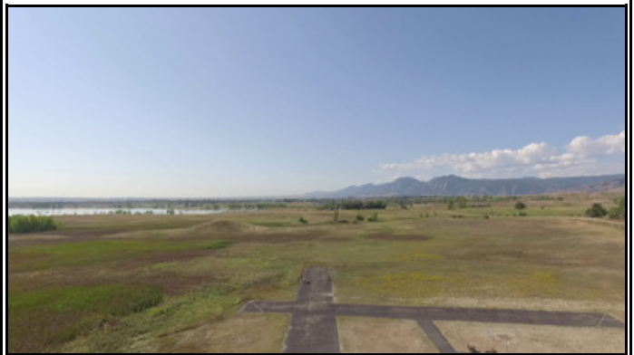
Aerial view of runway cleaning operations