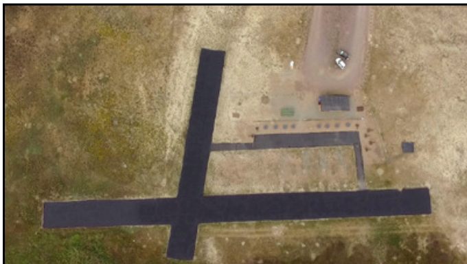
Next morning aerial view of completed sealcoat work

Superior Asphalt coated the runway surfaces twice, and then touched up spots where they wanted to apply more sealcoating.