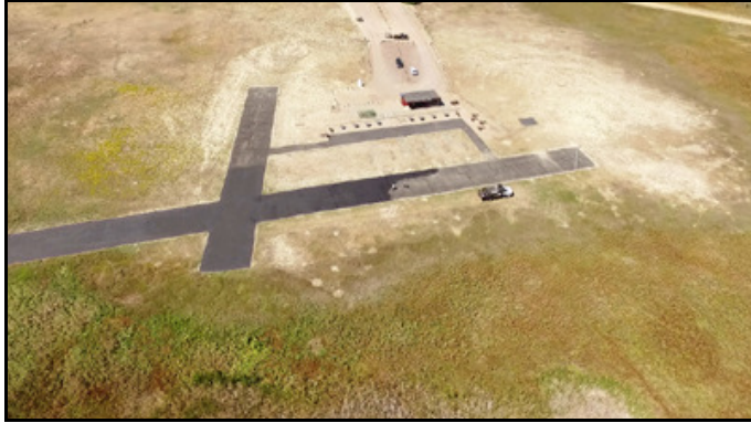
Aerial view of sealcoat spraying operations

The truck was then moved to the north side of the east/west runway about 1/2 ways down the length of the runway and the spray sealcoating processed was repeated.