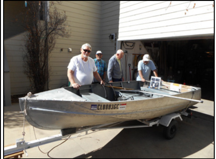
Getting the boat ready for the 2017 season.

The job included storage of the boat and trailer, boat and trailer registration, insurance, reservoir registration and inspection, weekly scheduling of flying, boat transporting to and from the reservoir, keeping the battery charged and any maintenance required.