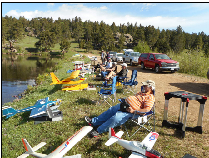
The crew, relaxing on the dam.

A stop for lunch at "Smokin' Dave's" BBQ in Lions rounded out a perfect day.