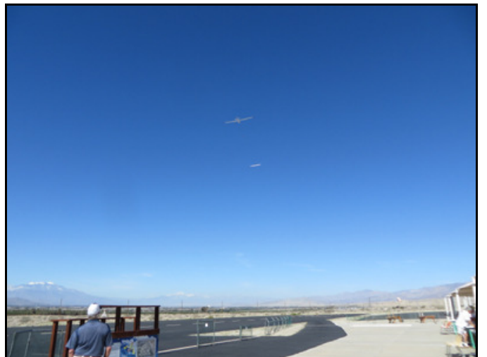
Glider tow in progress. Check out the blue sky and mountains in the background.