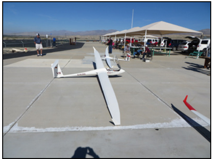
CVRC tarmac & shelter area..

If you know me, you know that I tend to fly gliders. Yet I purchased a Flex Innovations, Quique Extra 300, 48" foamie over at the AMA Expo West in Ontario in early January. It's "3D" capable, though really just a comfortable flying airplane which is small enough to fit in my Prius without removing the wings.