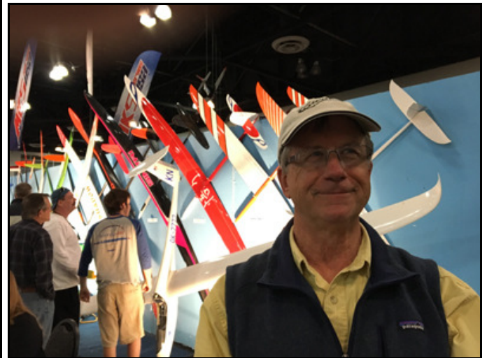
Here's another shot from the Expo..