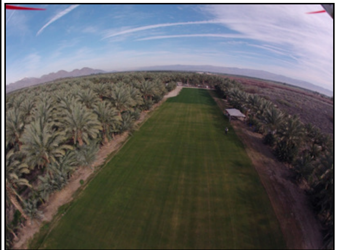
An aerial shot of Chacho's field.