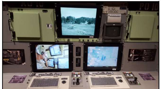
The flight panel...

Here's a You tube video of some launch activity. https://www.youtube.com/watch?v=ZhdByZrBGHs