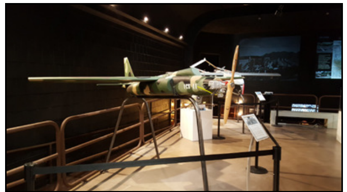
A drone on display.