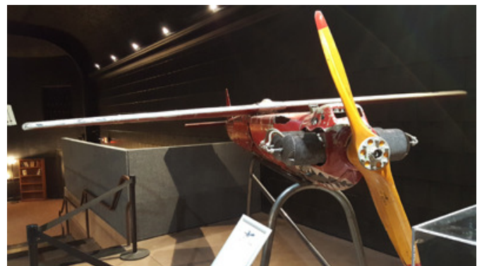
Here's one he said had been on some missions...