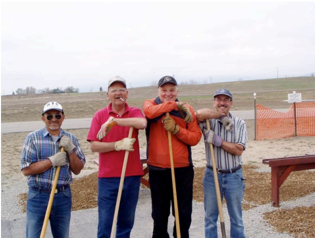
Must be a government job. Four supervisors leaning on shovel handles.

Here are some photos from the day, courtesy of Al Coelho.