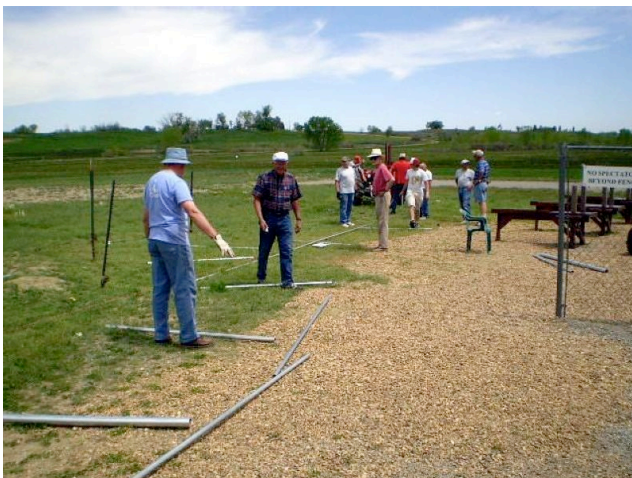
Installing the fence on the north side of the field.

The field work day on May 12 th was a success due to excellent turnout, and we put up some really nice new chain link fencing and stained the benches, in addition to trimming the fields and edges. I've included some photos below.