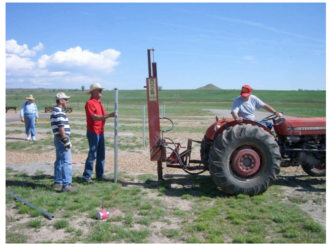
Dean and the crew driving in the posts for the flight station fencing.